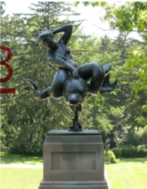
SUNGLITTER CARL MILLES 1918 (RECAST 2002) BRONZE