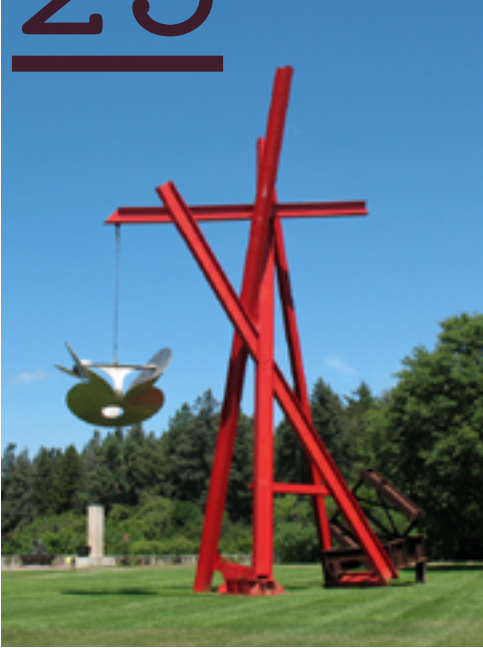
FOR MOTHER TERESA MARK DI SUVERO 1998, STEEL AND STAINLESS STEEL

Mark di Suvero (b. 1933) was born in Shanghai, China, to Italian parents who later immigrated to California. After receiving a degree in philosophy at the University of California, Berkeley, he moved to New York City to concentrate on his sculpture career. Severely injured in an accident on a construction site where he had a part-time job, he used his recovery period to perfect his welding skills. Over a long career, he has become one of the most important American sculptors, with his works installed internationally. He was awarded the National Medal of the Arts in 2010.