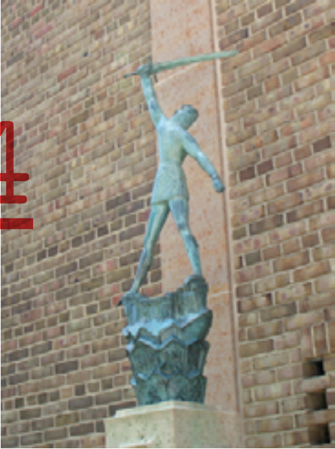
ENGELBRECHT CARL MILLES 1927, BRONZE

Engelbrecht Engelbrechtsson (or Engelbrekt Engelbrektsson) is a Swedish national hero. In 1434, he led an army of miners and peasants in a rebellion against Eric of Pomerania, the King of the Kalmar Union (the united countries of Denmark, Norway, and Sweden) to protest unfair taxation, pillaging, and foreign rule. Milles presents Engelbrecht as a warrior, defiantly thrusting his sword into the air.