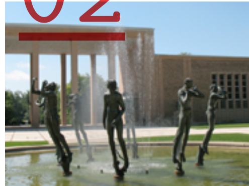
ORPHEUS FOUNTAIN CARL MILLES CAST 1937, BRONZE

In Greek mythology, Orpheus was a musician and poet who could calm wild beasts and coax rocks and trees to dance with the beauty of his songs. His wife, Eurydice, was killed by the bite of a serpent. Orpheus, stricken with grief, descended into Underworld in search of her, where his music charmed Hades, the lord of Underworld. The circle of eight figures in the Cranbrook version of the fountain could represent shades (or souls) from the Underworld, or as Milles himself has been quoted as saying, simply "people listening to music." The only identifiable figure in the group is that of Beethoven, who, in his deafness, raises his arms in a gesture of despair because he cannot hear Orpheus's music. The original Orpheus Fountain in Stockholm, Sweden, has a 38-foot figure of Orpheus in the center, which is omitted from the Cranbrook version.