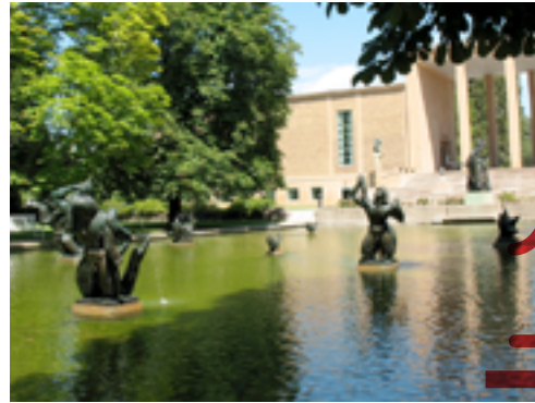
TRITON POOL CARL MILLES CAST CIRCA 1926, BRONZE

Tritons are mythological sea creatures with human torsos and dolphin tails. They are often depicted as carrying conch shell trumpets with which they control the climate of the sea. Part of their mythological role was to accompany gods and goddesses crossing the ocean. In this case, they are escorting Europa and the Bull (Zeus) on their journey to Crete.