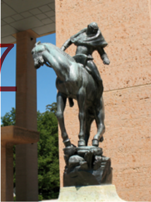
FOLKE FILBYTER ON A HORSE CARL MILLES 1927, BRONZE

Carl Milles was inspired by Nobel Prize winning author Verner von Heidenstam's book The Tree of the Folkungs which included the legend of Folke Filbyter. Filbyter's saga takes place in Medieval Sweden during a struggle between heathens and Christians. Monks kidnapped his grandson and Filbyter spent 25 years searching for him. The sculpture shows him as an old man near the end of his search, on his horse crossing a stream.