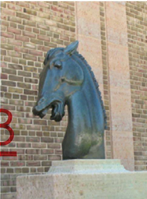
HORSE'S HEAD CARL MILLES 1927, BRONZE

This piece is a larger version of the horse's head found on the Folke Filbyter on a Horse sculpture (#7). The smaller sculpture was completed as a study for the Folkunga Fountain in Linköping, Sweden. This horse's head is fabricated at the scale used in the fountain.