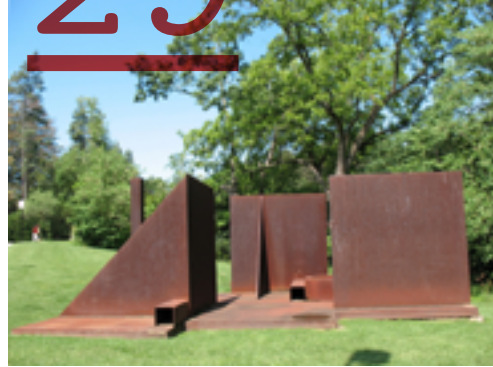
CRANBROOK IN-GATHERING TONY ROSENTHAL 1980, CORTEN STEEL

Rosenthal worked at Cranbrook with Carl Milles from 1939-1940. This is the first time Rosenthal had been commissioned to do a piece in a "non-urban" setting.