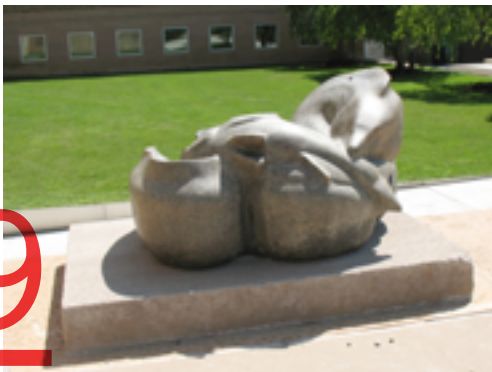
MORAY EEL AND FISHES MARSHALL FREDERICKS 1941, GREEN GRANITE

Moray eels are long, snakelike fish. They hide during the day and come out at night to hunt for small fish. Here Fredericks is playing with the proximity of his granite sculpture to the Triton Pools . He was known for incorporating lighthearted humor and a gentle humanist spirit into his works.