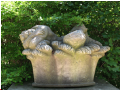
SLEEPING PAN AND SLEEPING FAWN CARL MILLES 1928, WHITE MARBLE

These two figures are mounted on either side of a gate designed by Eliel Saarinen. In Greek mythology, Pan is the god of shepherds, flocks, hunting, and music. He is identified as being part human and part goat, with the torso of a man and the hindquarters, legs, and horns of a goat. Pan is often associated with fertility and the season of spring. Fawn is the sculpture adjacent to Pan . In many cultures, deer symbolize gentleness, grace, beauty, and balance. They exemplify keen observation and sensitivity as well as harmony with nature.