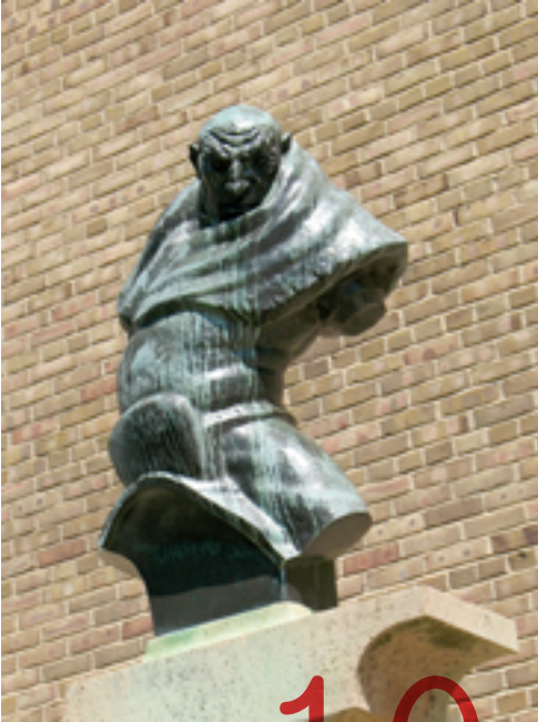
TORSO OF FOLKE FILBYTER CARL MILLES 1927, BRONZE

This piece is a larger version of the rider's body found on the Folke Filbyter on a Horse sculpture (#7). The smaller sculpture was completed as a study for the Folkunga Fountain in Linköping, Sweden. This torso is fabricated at the scale used in the fountain.