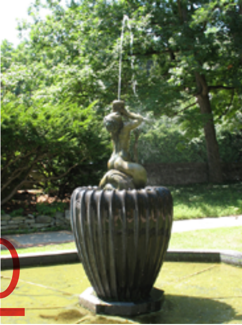
TRITON WITH SHELL CARL MILLES 1918, BRONZE ON GRANITE BASE

In Greek mythology, Triton was the son of Poseidon, god of the sea. He had the form of a human torso combined with a dolphin tail, much like a mermaid or merman. Like his father, Triton carried a triton, or three-pronged spear. He also carried a conch shell that functioned as a trumpet that could calm or stir up ocean waves.