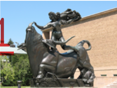
EUROPA AND THE BULL CARL MILLES CAST 1935, BRONZE

In Greek mythology, Europa was a Phoenician woman with whom the God Zeus fell in love. He turned himself into a white bull and joined her father's herd of cattle. Europa saw the bull and finding it tame, climbed upon its back. The bull headed for the sea, and swam with her on its back to the island of Crete, where Zeus revealed his true identity. In Milles's version, Europa shows no fear as she reaches playfully to touch the tip of the enamored bull's tongue.