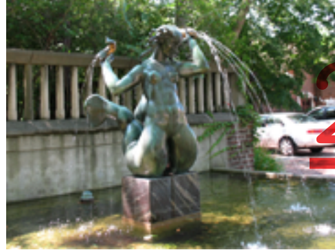
NAIAD WITH FISHES CARL MILLES 1918, BRONZE

Naiads are nymphs that preside over fresh water—fountains, wells, springs, streams, and brooks. This Naiad would be classified as a Krenaiad, a Naiad of a fountain. In Greek mythology, Naiads were immortal deities; however, a Naiad's vitality was bound to her spring, so if a Naiad's body of water dried up, she would die.